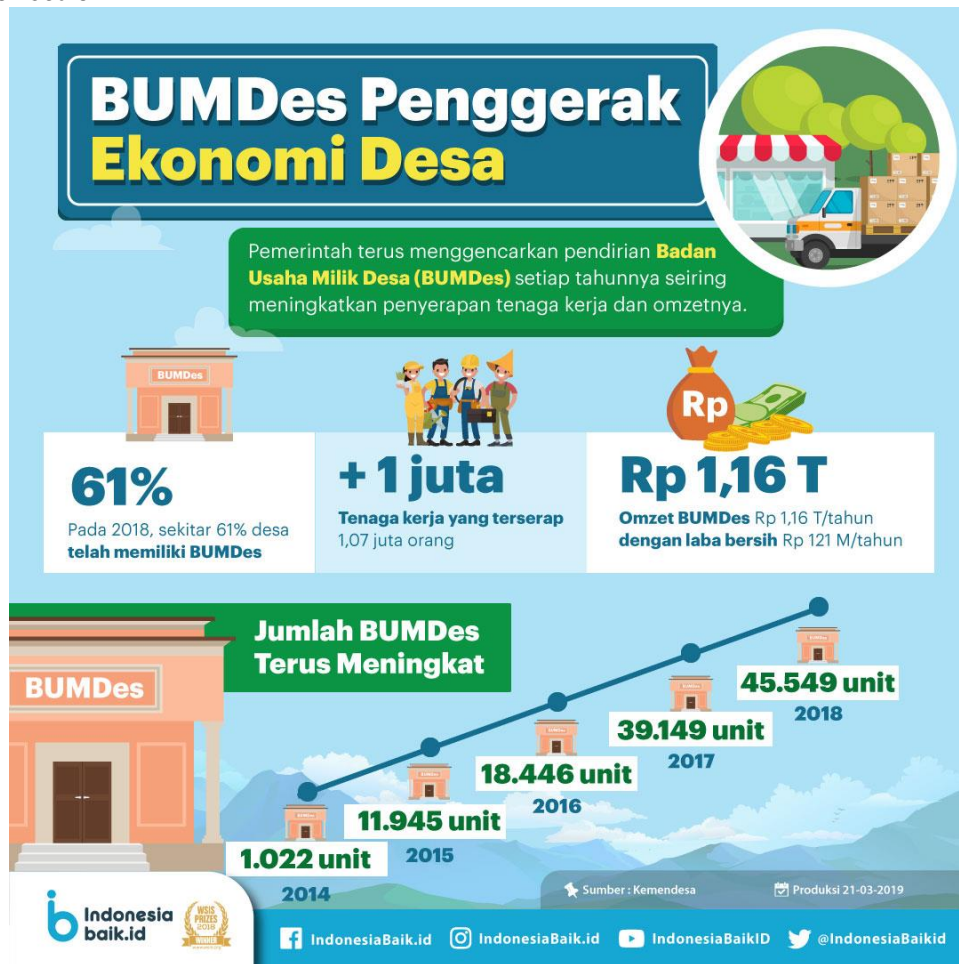
Figure 2. BUMDes that drive the village economy sourced from (Finaka & Hapsari, 2019)

From the data above, it can be seen that BUMDes will also have a positive effect on the economy which provides a place to work for more than one million Indonesian workers. This has a positive effect which not only gives movement to the wheels of the economy, but also provides a funding effect for the country which has recorded a net profit of more than 120 billion rupiah. This is a sign that in the long term will have a significant effect on village development. Of course, this will greatly assist the development of the welfare of the people of Indonesia.